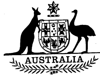
Stylised Arms No. 2 (Solid) Emblème stylisé No. 2 (Plein)