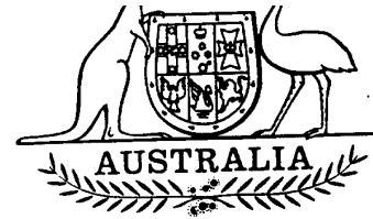
Stylised Arms No. 1 (Outline) Emblème stylisé No. 1 (Contour)