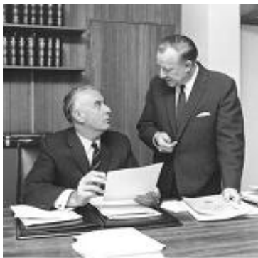
duumvirate government (means ministry of two)

"Be it enacted by the Queen's Most Excellent Majesty, the Senate and the House of Representatives of the Commonwealth of Australia .."